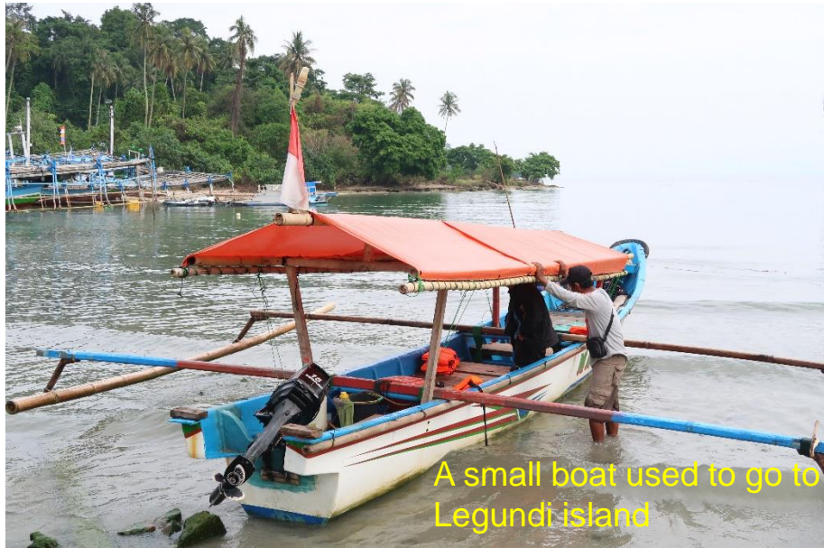
A small boat used to go to Legundi island

Collapsed houses near the coast (Inundation depths at measurement points: 1.2-1.3m)