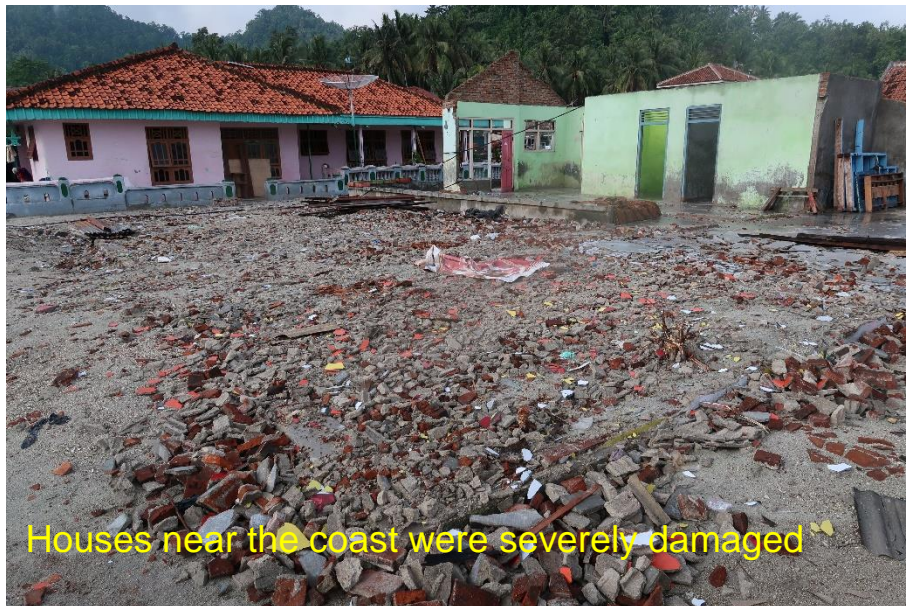
Houses near the coast were severely damaged